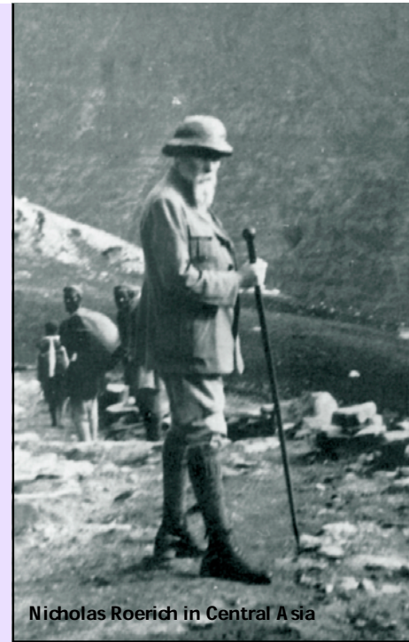
Nicholas Roerich in Central Asia