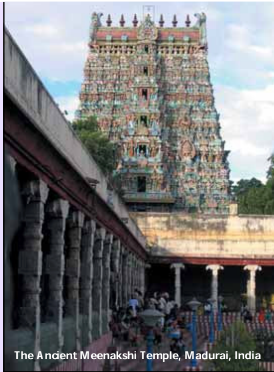
The Ancient Meenakshi Temple, Madurai, India

Unexpectedly, wherever they traveled, they heard legends about Jesus. In his book Altai-Himalaya published in 1929, which was more of a travel diary, he says, “In Srinigar we first encountered the curious legend